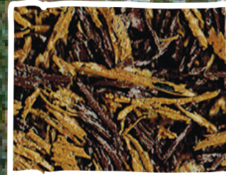
Earth Tone 1