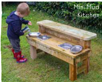
Mini Mud Kitchen

From an early age, children are fascinated with splashing around with MUD! Either making mud pies or hunting for worms, they can spend hours up to their elbows in it.