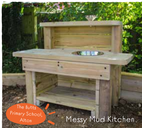
The Butts Primary School, Alton