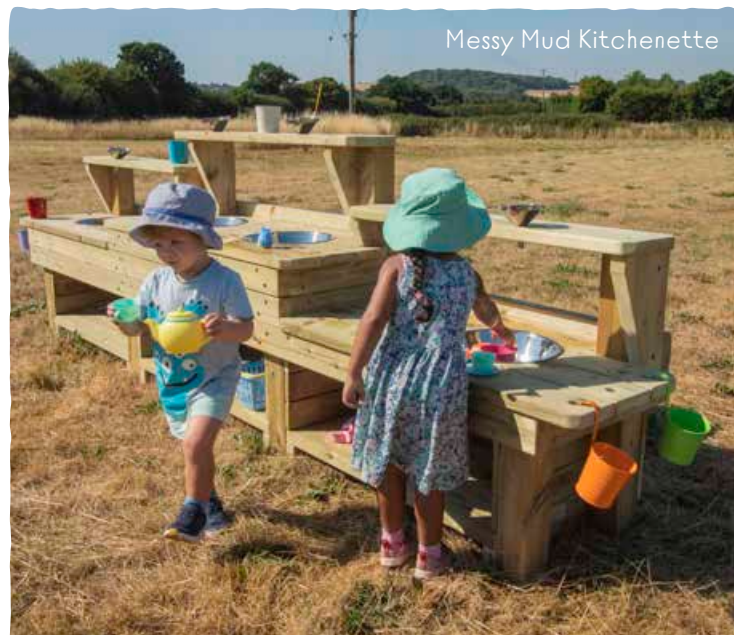
Messy Mud Kitchenette

To help in aiding their messy play, we have a growing range of Mud Kitchens suited to pre-school and early years through to juniors.